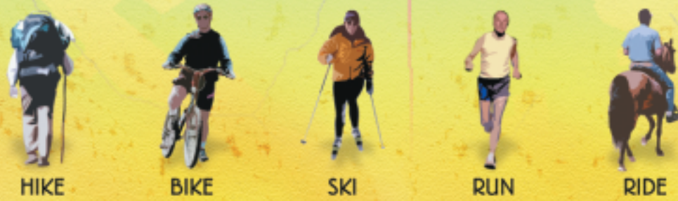
HIKE BIKE SKI RUN RIDE